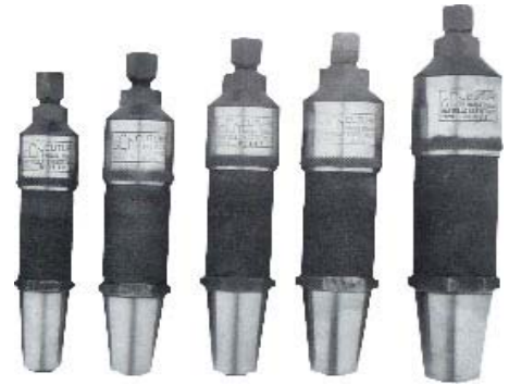
TYPE U T S R Z

ITEM CODE BAVCUHAMR BAVCUHAMS BAVCUHAMT BAVCUHAMU